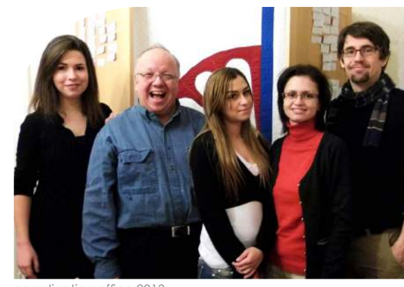
coordination office 2013

Phiren Amenca maintains a coordination office and resource centre for the volunteers and member organizations in Budapest (which is currently the home of RGDTS non-profit kft.).