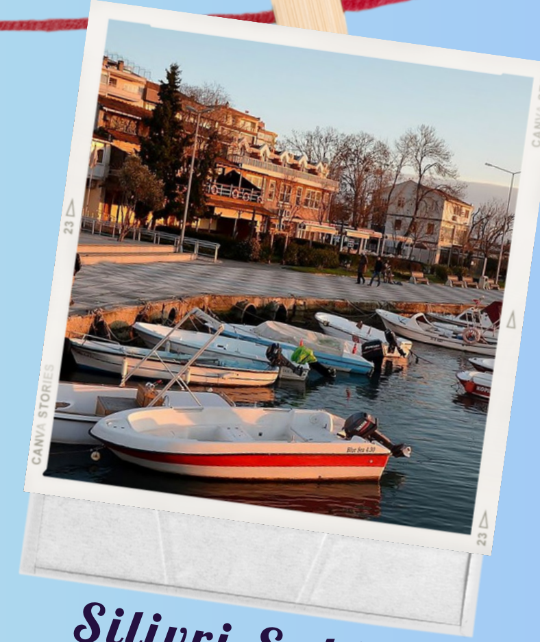
Silivri Sahili (Silivri Sea Sight)