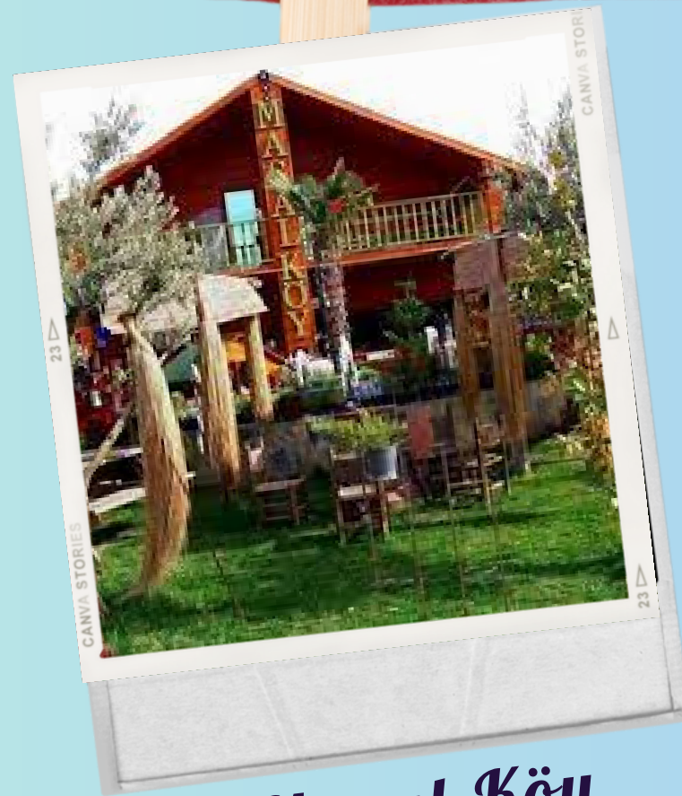
Masal Köy (Tale Village)