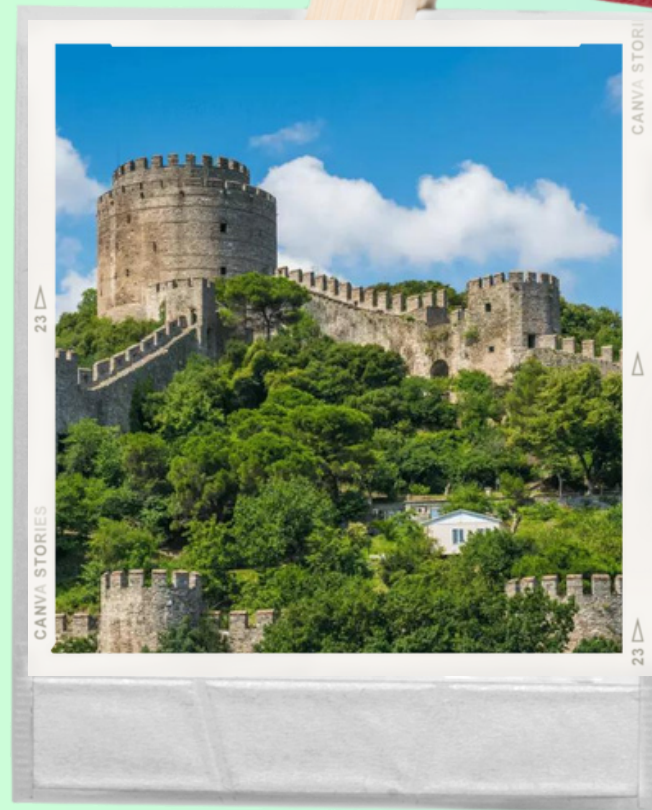
Silivri Kalesi (Selymbria Fortress)

Here are some recommendations to visit in your free time during the seminar: