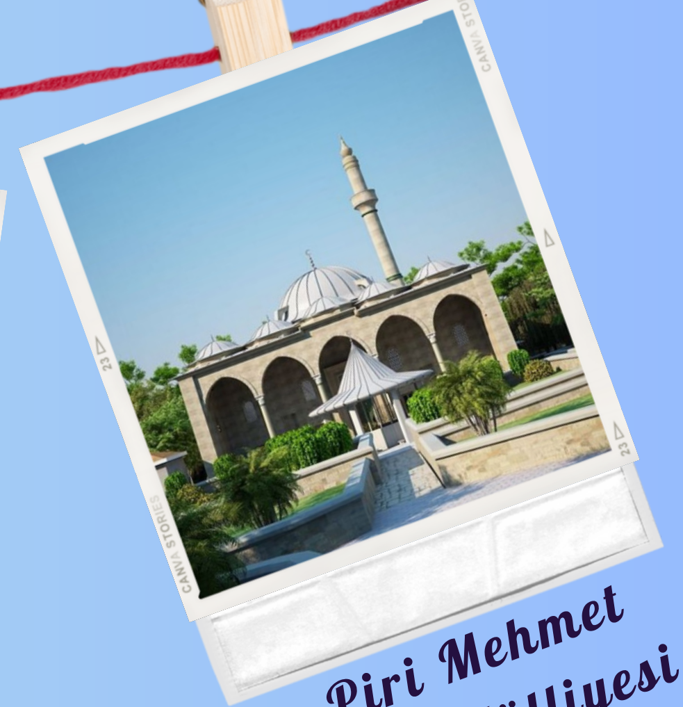
Piri Mehmet Paşa Külliyesi

Check the municipality's website out for more details and options: http://www.silivri.bel.tr/ .