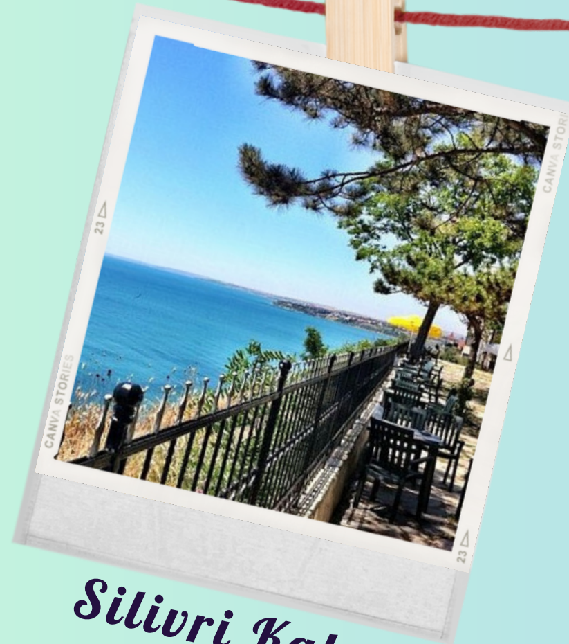
Silivri Kale Park